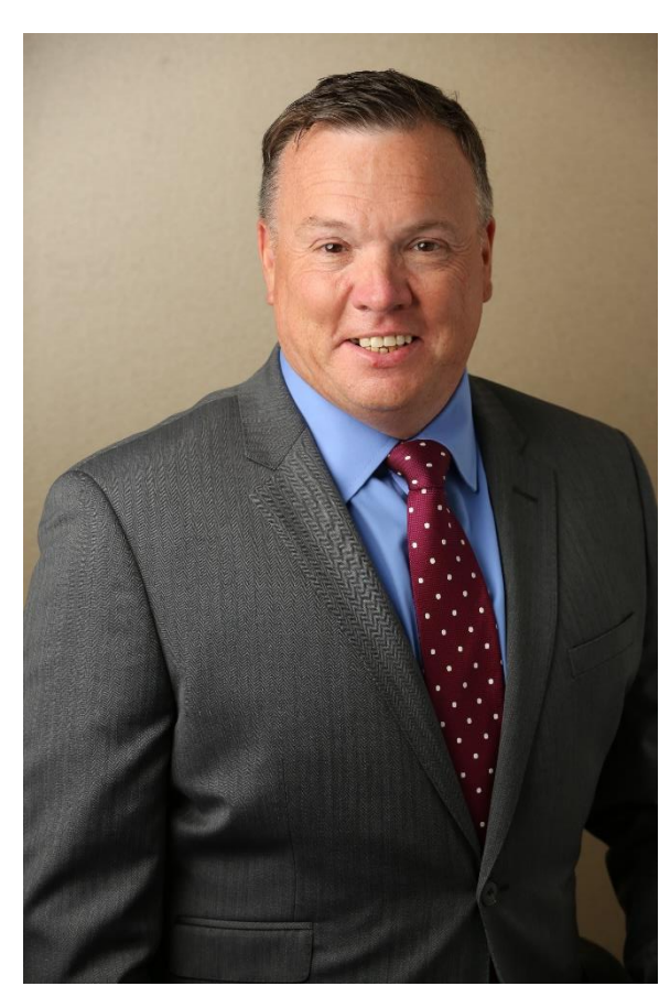
all areas and background. Candidates for election

In seeking re-election to Council, I do so because I feel passionate about the profession I have come to as a second career. If chosen again by the members of this Council area, I will represent them in an objective and pragmatic way.